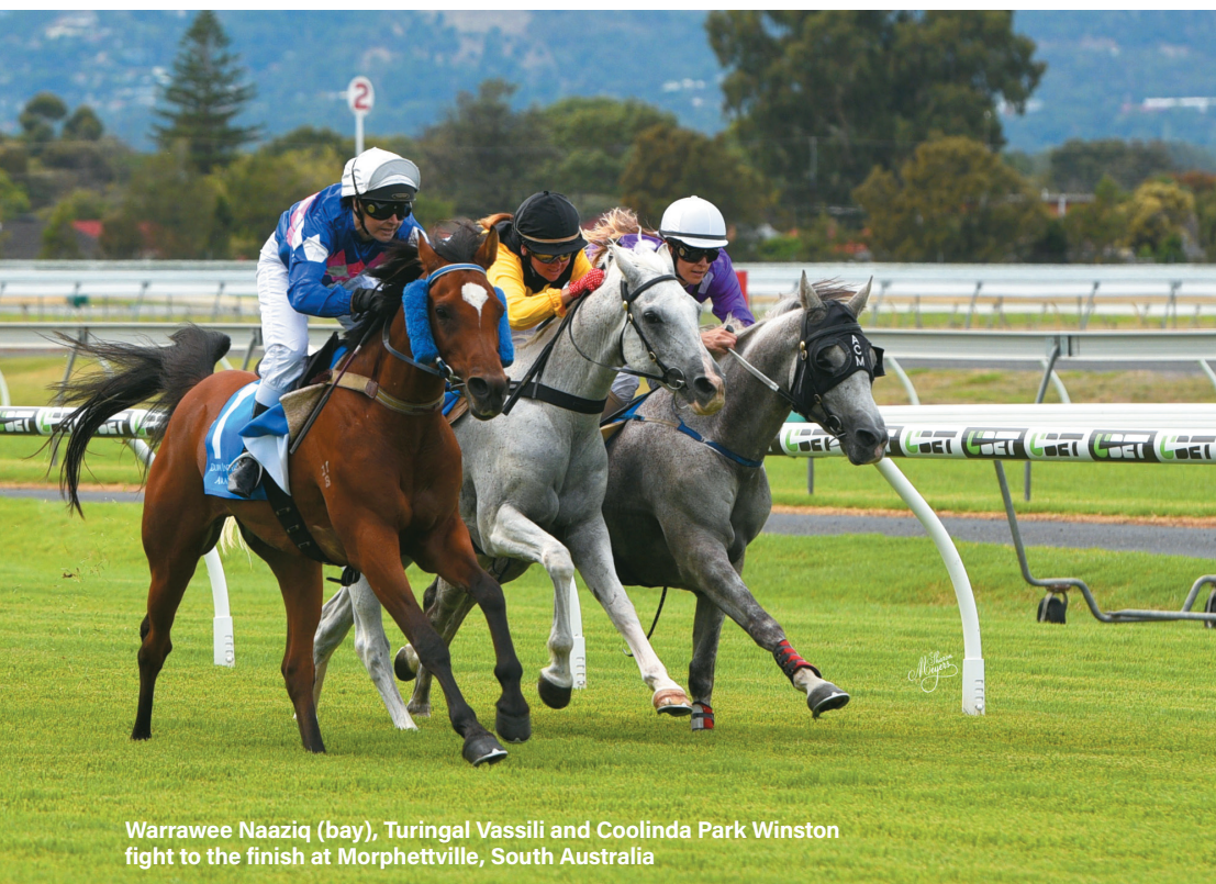
Warrawee Naaziq (bay), Turingal Vassili and Coolinda Park Winston fight to the finish at Morphettville, South Australia