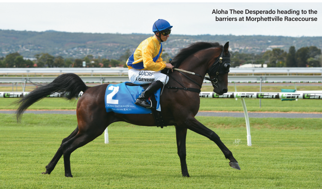
Aloha Thee Desperado heading to the barriers at Morphettville Racecourse

For more information please visit www.naraaustralia.com