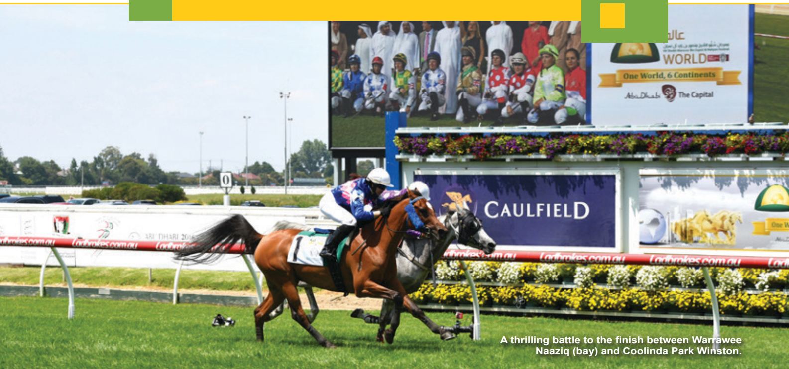
A thrilling battle to the finish between Warrawee Naaziq (bay) and Coolinda Park Winston.