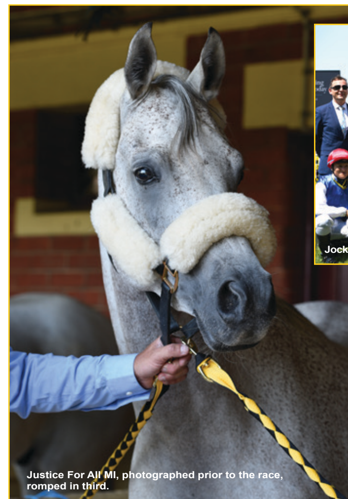
Justice For All MI, photographed prior to the race, romped in third.