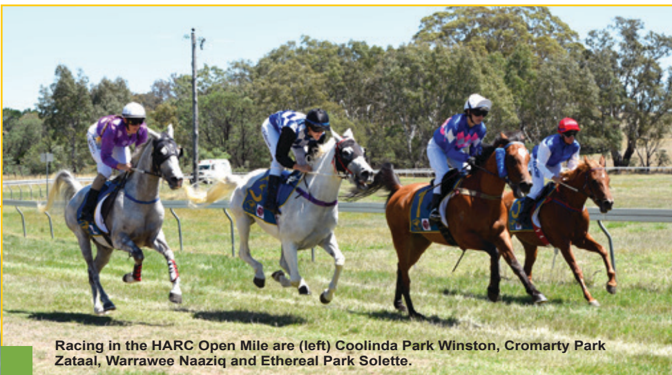
Racing in the HARC Open Mile are (left) Coolinda Park Winston, Cromarty Park Zataal, Warrawee Naaziq and Ethereal Park Solette.