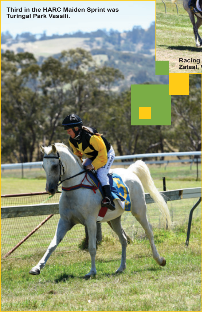
Third in the HARC Maiden Sprint was Turingal Park Vassili.

The next day, an 8am start saw the first of an all-