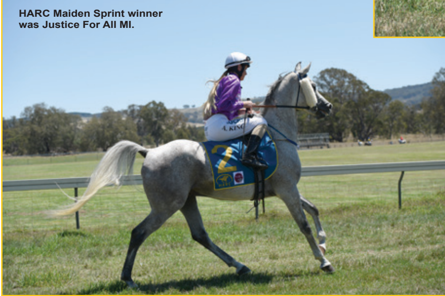
HARC Maiden Sprint winner was Justice For All MI.

racing fans enjoyed a lunch provided by the committee of the National Arabian Racehorse Association (NARA) after cheering the Arabians home across the finish line. It turned out to be a relaxing social event.