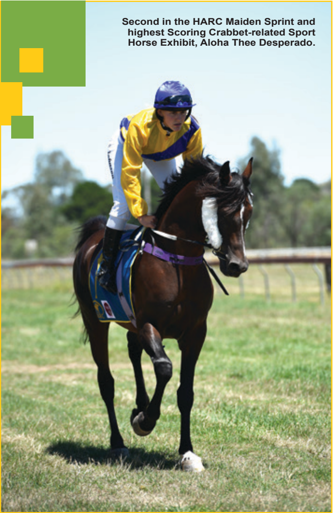
Second in the HARC Maiden Sprint and highest Scoring Crabbet-related Sport Horse Exhibit, Aloha Thee Desperado.